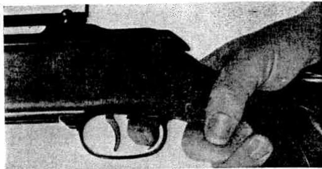
To operate the double-set trigger on the Tradewinds, you first pull the rear trigger hard. That sets the front trigger for a light pull. As on most models, trigger pull is adjustable

The sportsman who displays his guns in a rack or on a wall will want a rifle that is as good in looks as in performance. Some models are offered in several "grades," or price lines that differ from each other chiefly in finish and